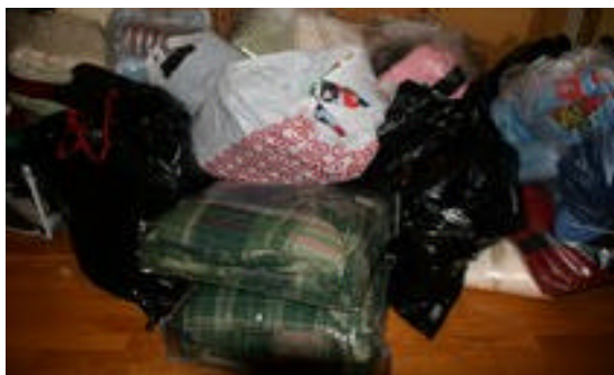
Over 140 blankets collected!